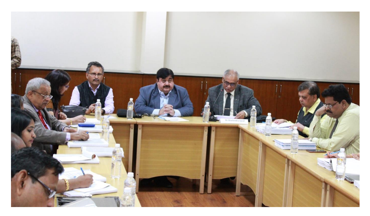
Members engaged in M.Pharm syllabus discussion