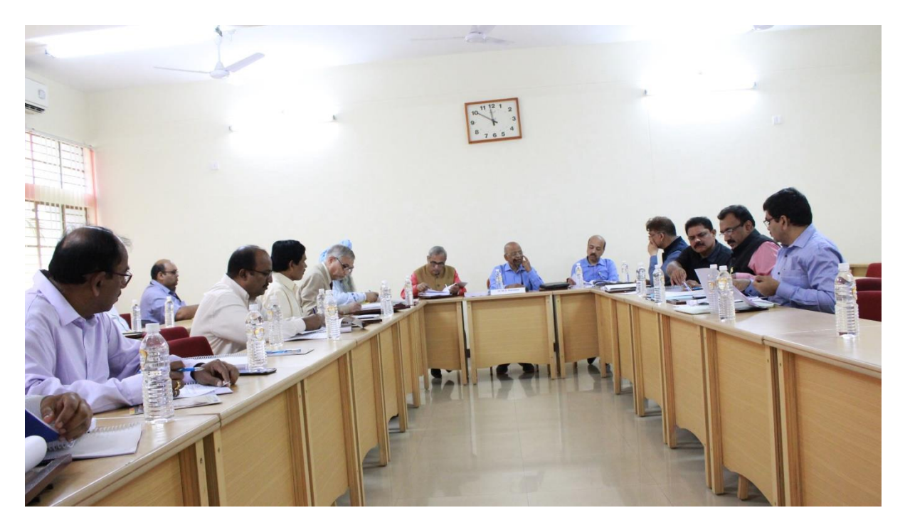
Members engaged in B.Pharm syllabus discussion