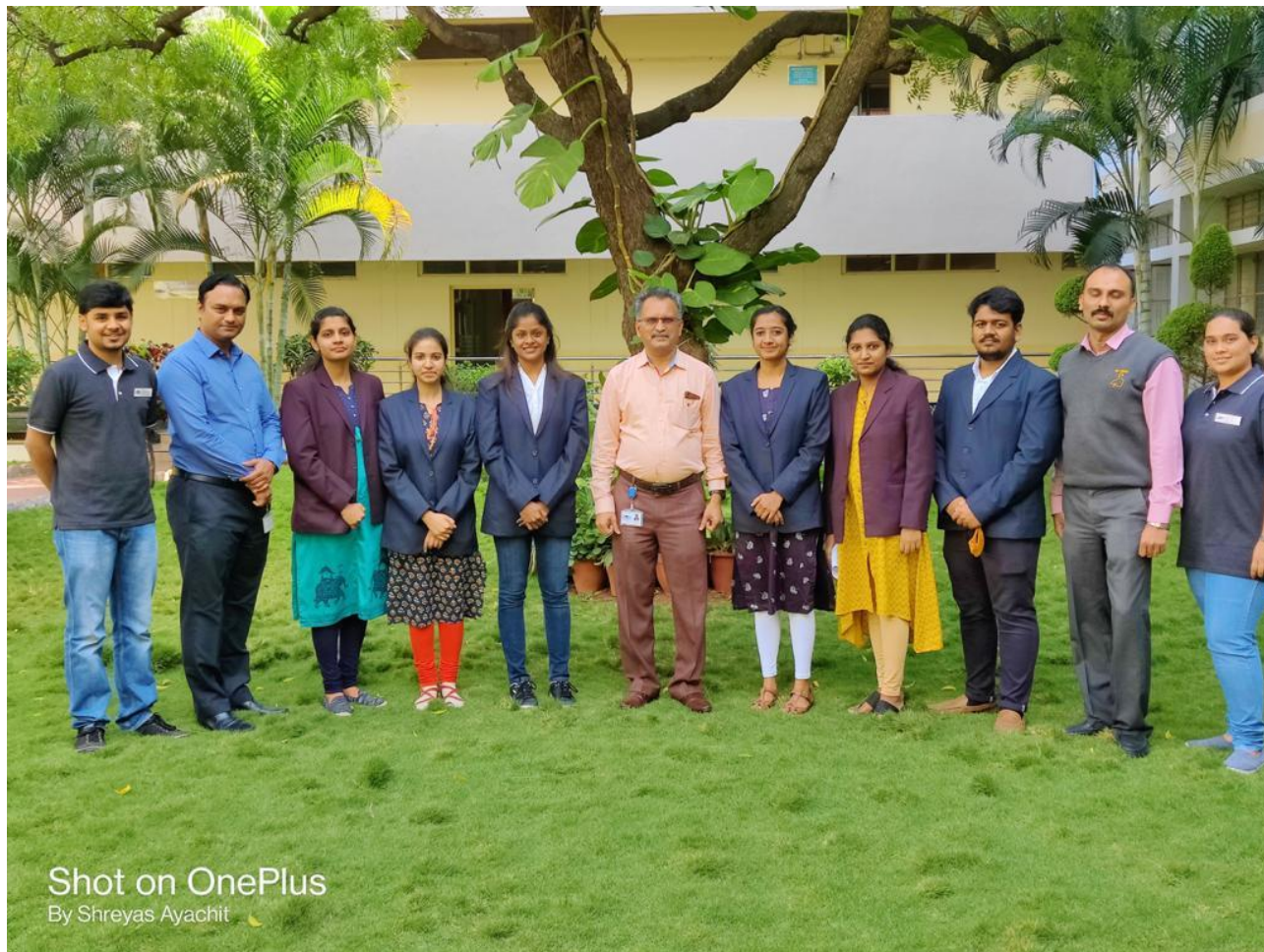
Jovial Students with The Principal and Training and Placement