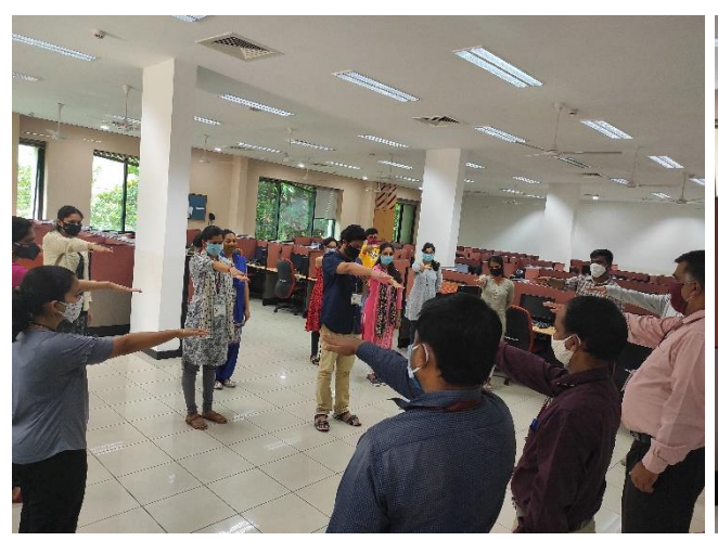
Oath taking to commit ourselves to serve the people