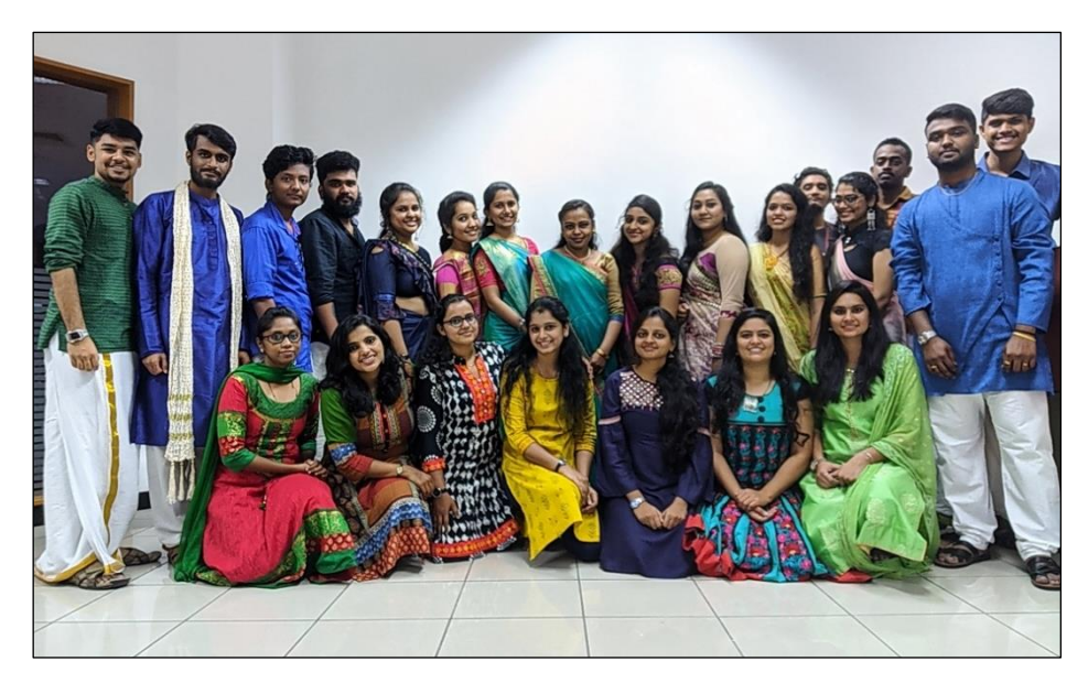
The TEAM at Infosys, Mysuru.