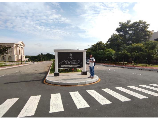
Infosys Global Campus