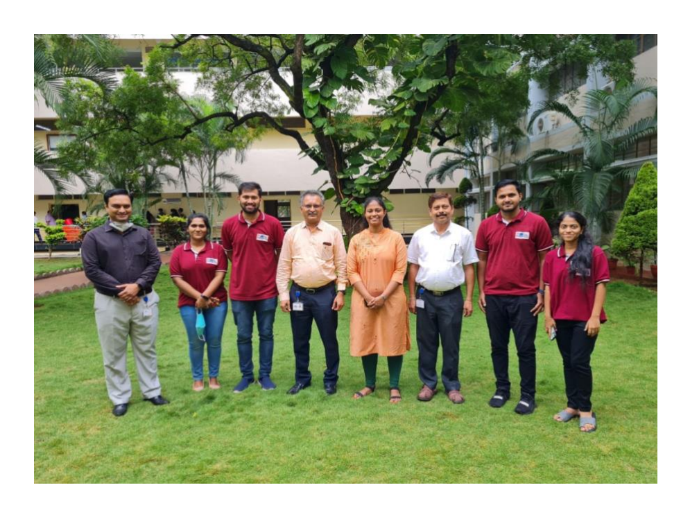
Students with The Principal and Training and Placement Cell Team

Sri Shivarathreeshwara Nagar,Mysuru-570015 TRAINING AND PLACEMENTCELL