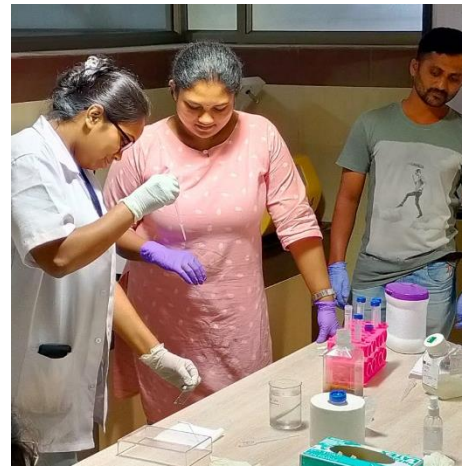
Participants preparing the metaphase spread on the glass slide