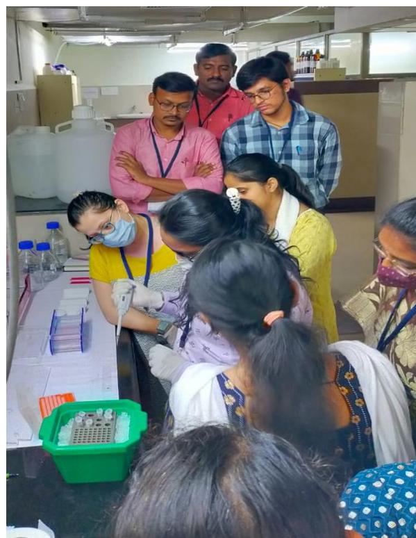
Participants loading the isolated DNA and RNA samples in the agarose gel for electrophoresis