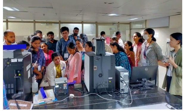
Demonstration of master mix preparation and setting up the PCR