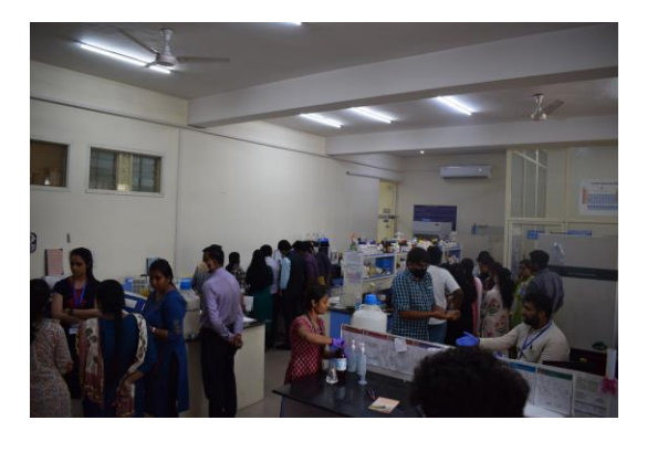
Workshop participants in CEMR Lab