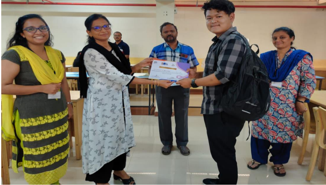
Winner receiving the certificate of appreciation from the judges

The programme had an overwhelmingly good response and all the participants received a certificate of participation. The best 5 drawings were displayed on the student wall magazine “STUMAG”.