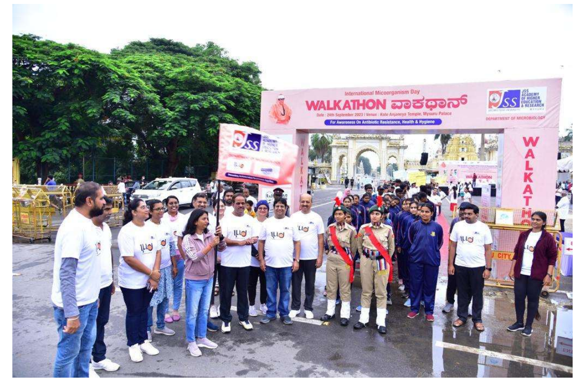
Flagging off the Walkathon event