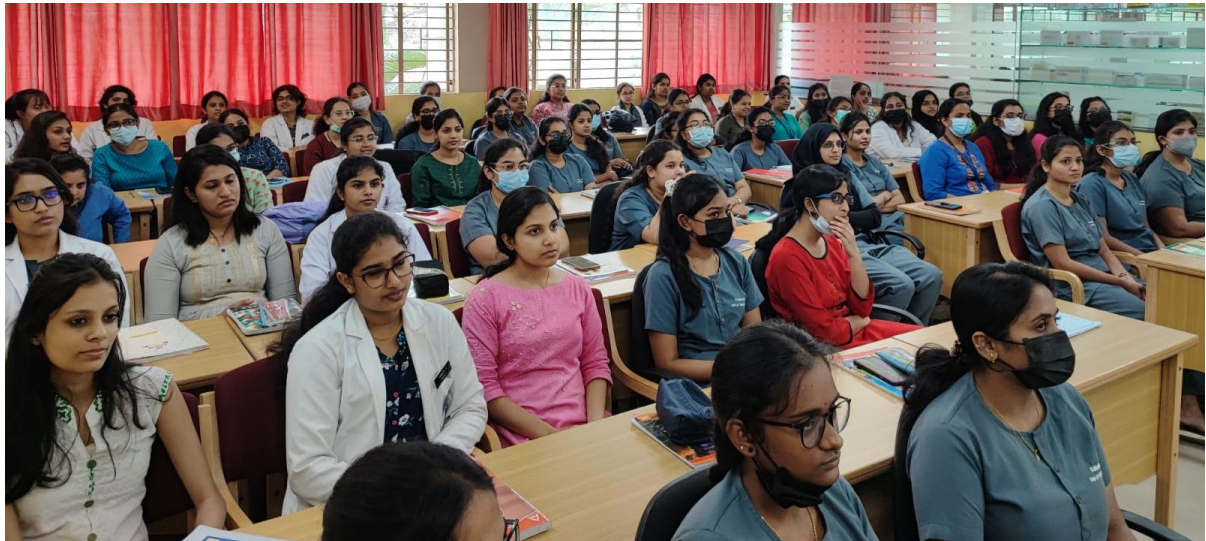
Students attending the guest lecture