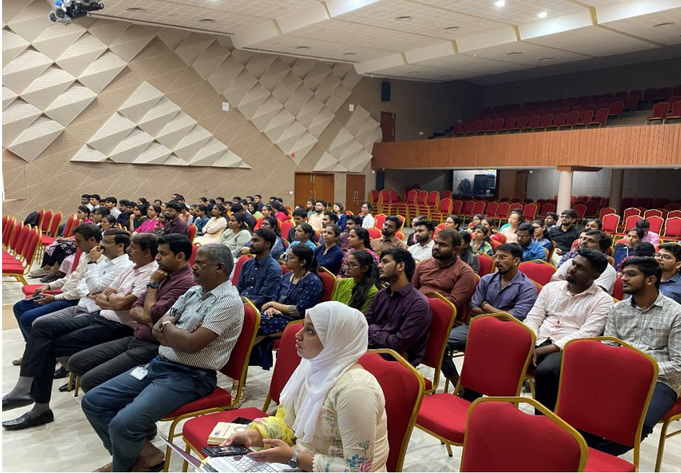
Staff and students attended the session