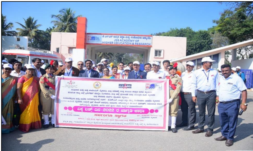
COMPLETION OF JAATHA