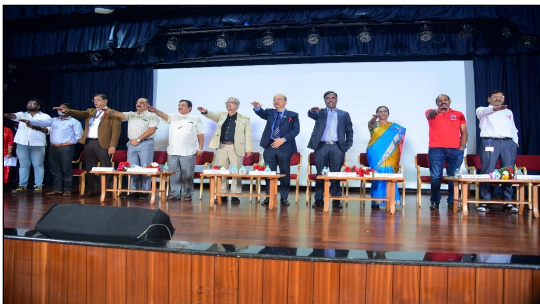
Oath taking conducted to create awareness about AIDS and prevention of the same