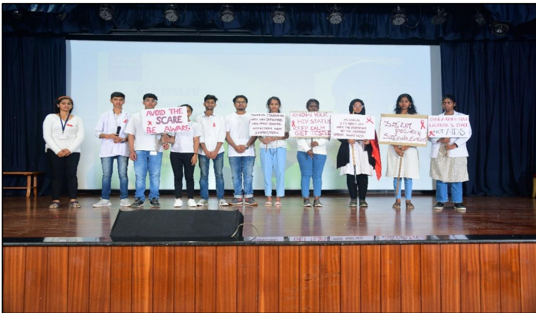
Students performing stage drama on behalf of the World AIDS Day