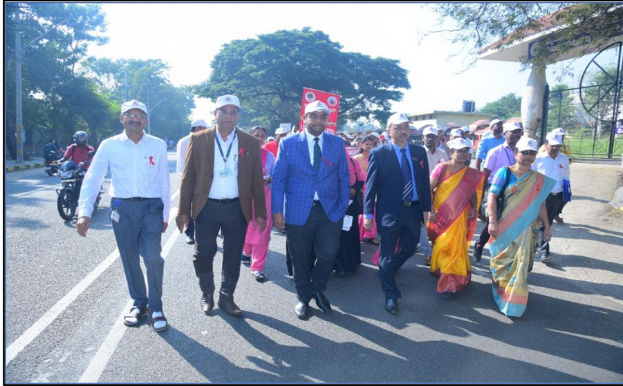
GLIMPSE OF JAATHA