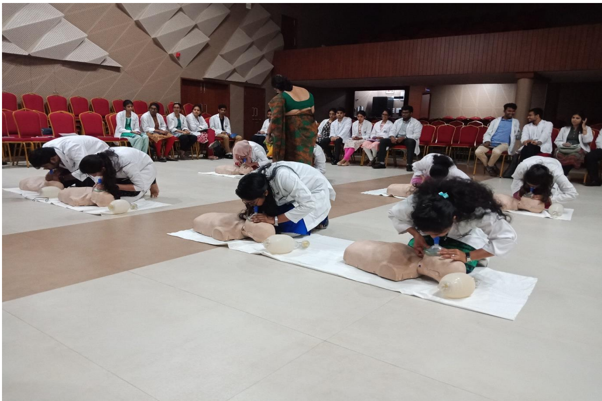
V Pharm.D students performing Cardiac Pulmonary resuscitation (CPR)