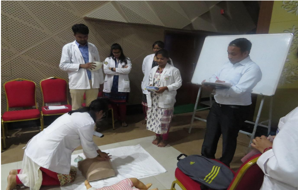
V Pharm.D students evaluated by the instructor in their practical performance