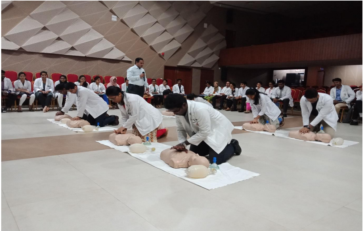
Practical sessions conducted for V Pharm.D students in presence of instructors.