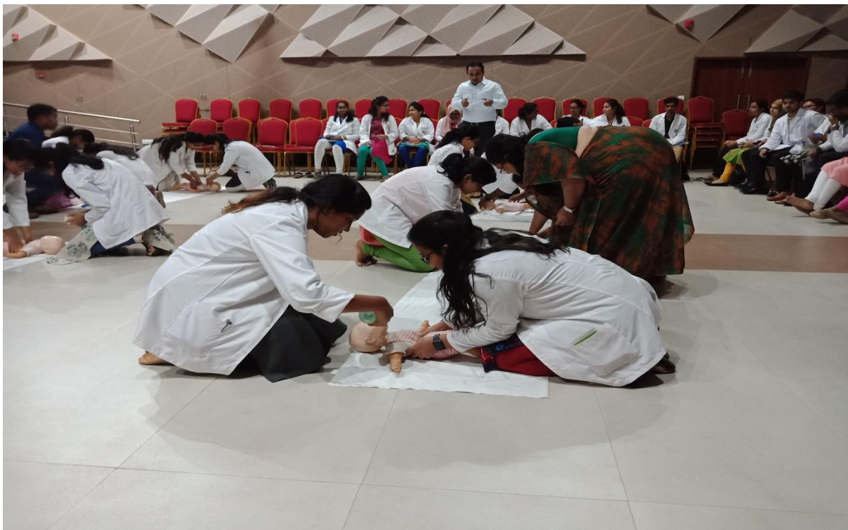
Students are trained in Basic Life support for infants by the trainers