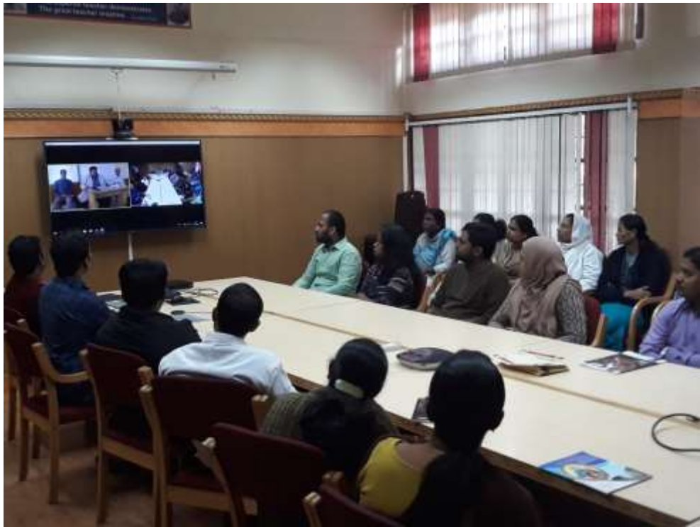
Pro Chancellor Addressing the freshers of PhD