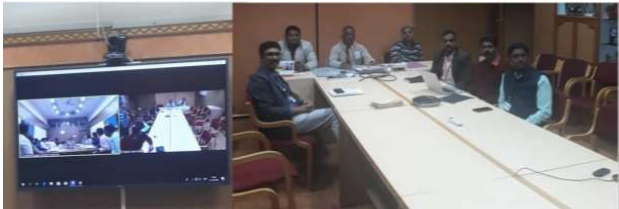
Pro Chancellor and Vice Chancellor deliberations on Innovations Day