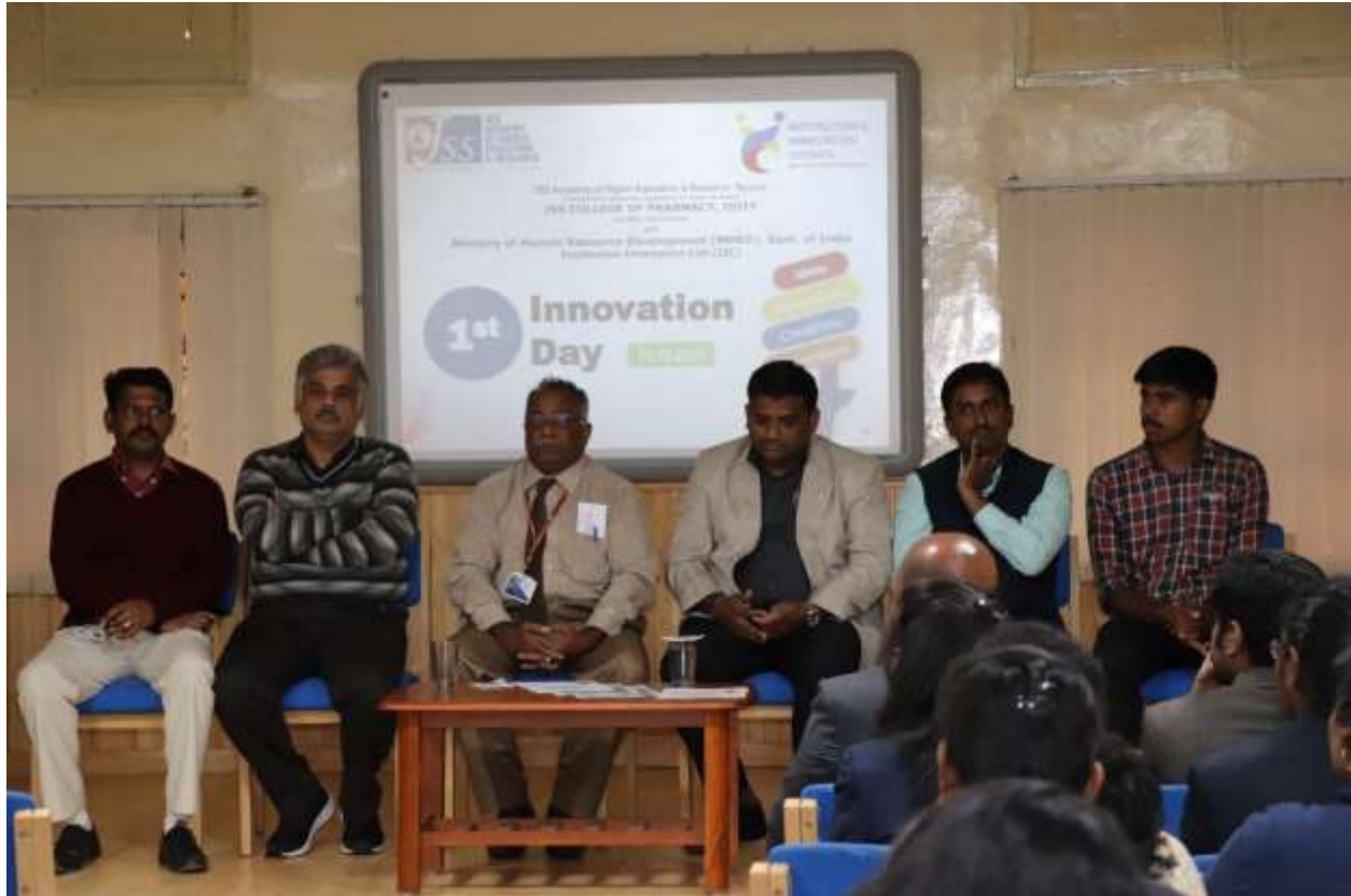
Inauguration of Innovation Day