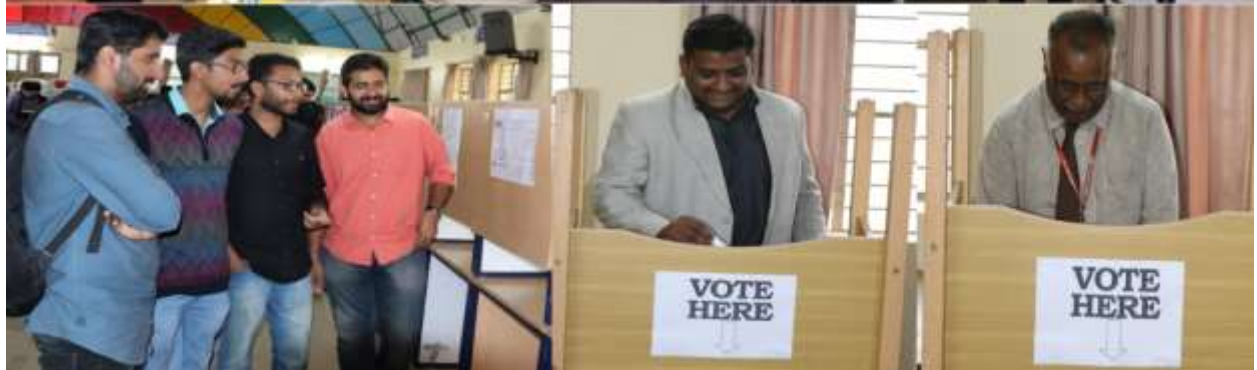
Glimpses of the Innovative poster presentations by UG, PG and PhD Scholars