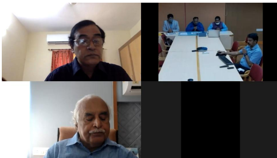
Figure 1. Snapshot of introduction to workshop and speakers.