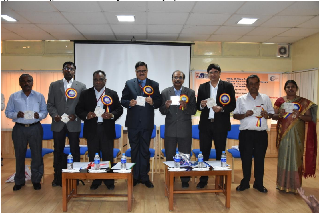
Figure 2. Release of scientific chronicle