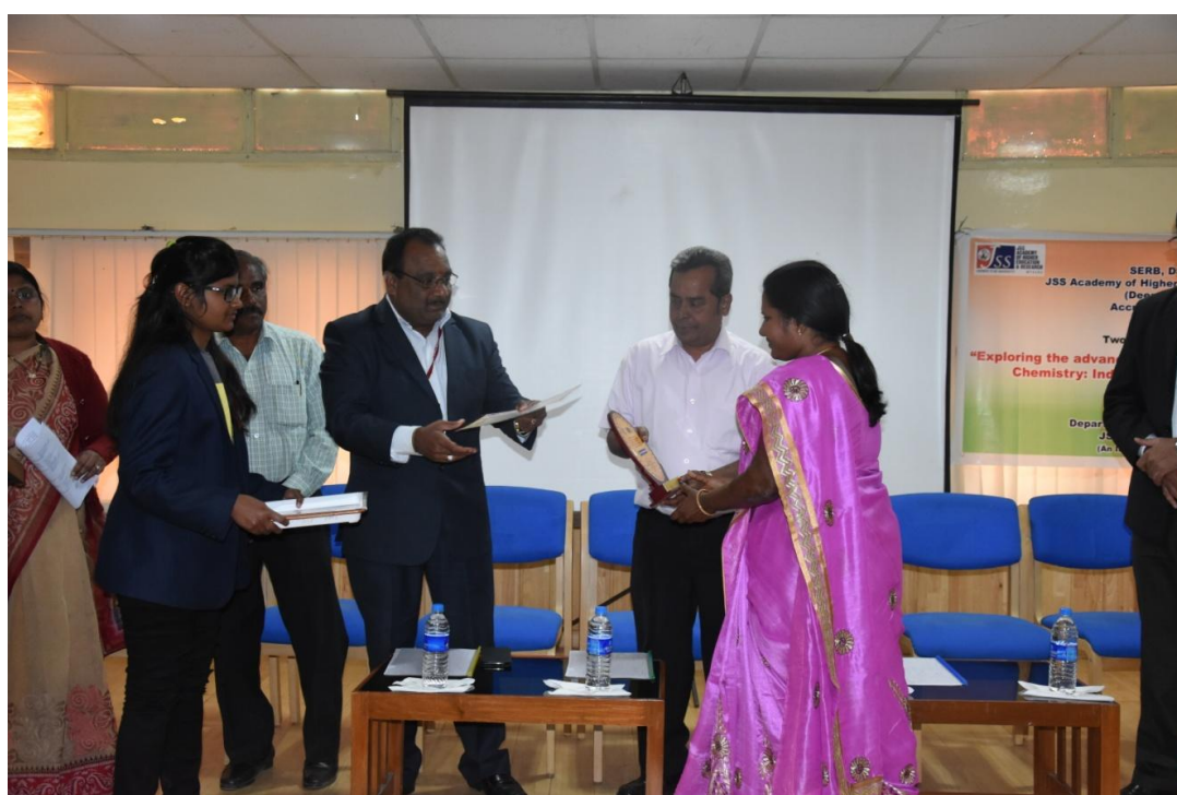
Figure 6. Best e-poster award for one of the delegate