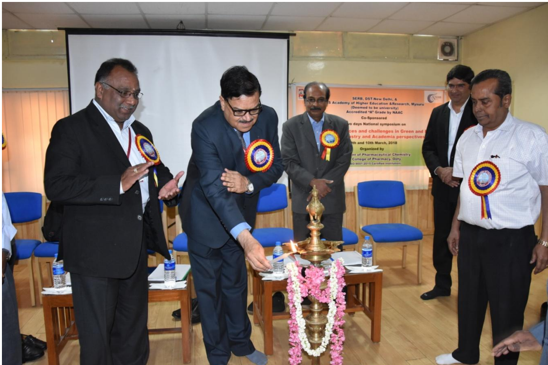
Figure 1. Inauguration of two days national symposium.