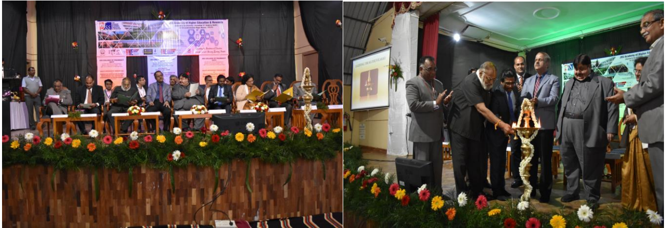
Guests for Inaugural Function.