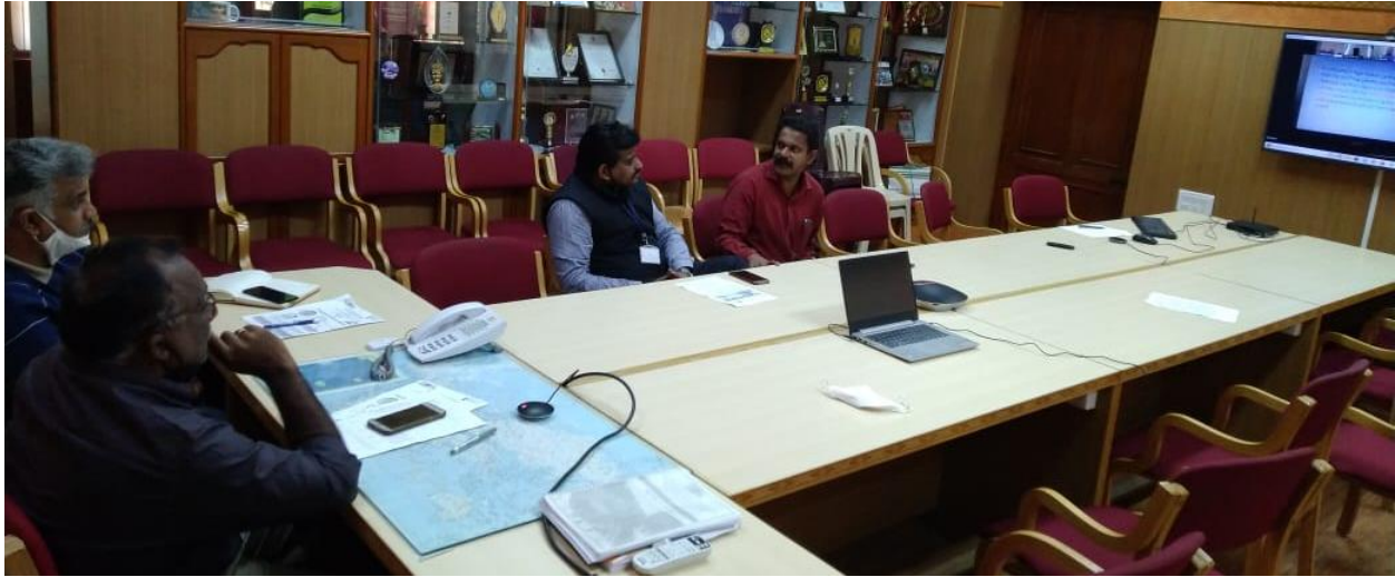
Image from board room hosting the Webinar