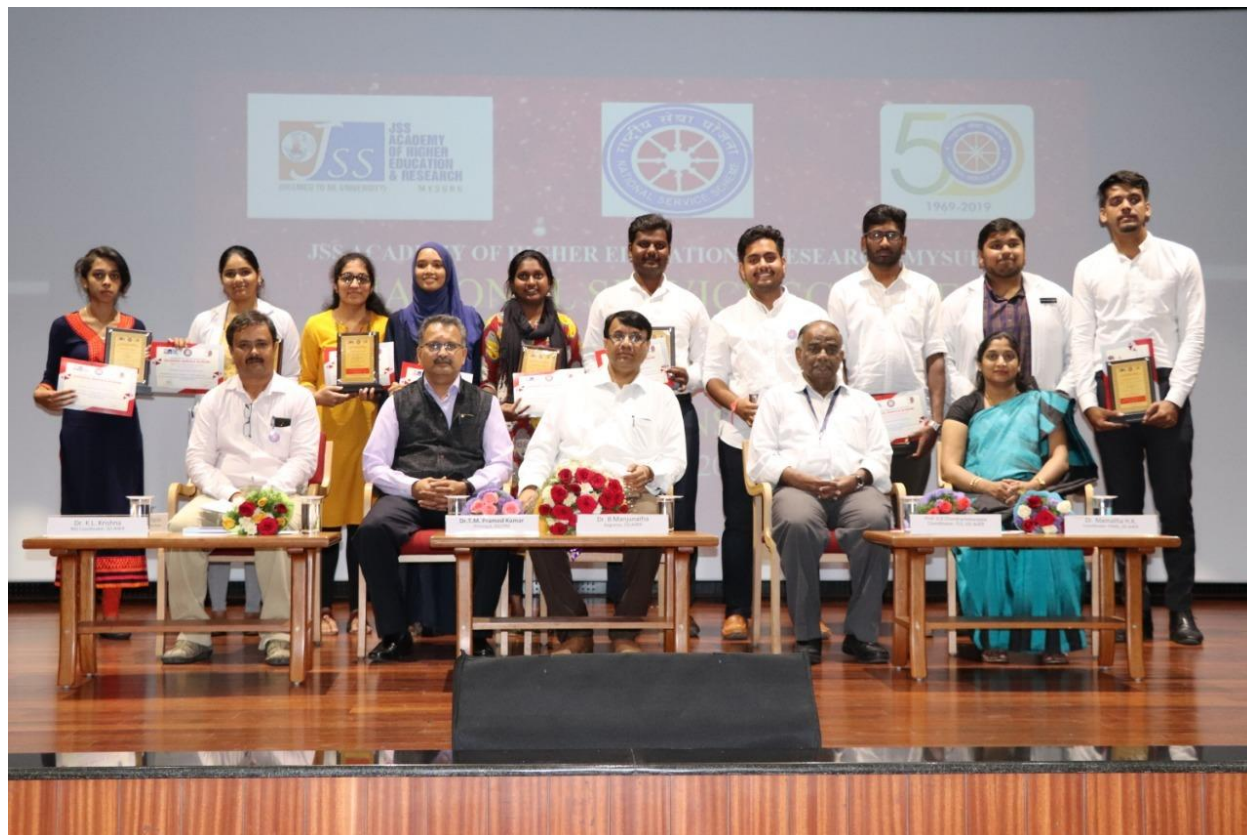
NSS Best Volunteers for the year 2017-18 given during NSS day celebrations.