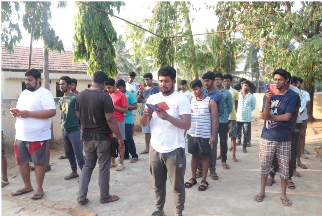
Morning assembly for flag hoisting .