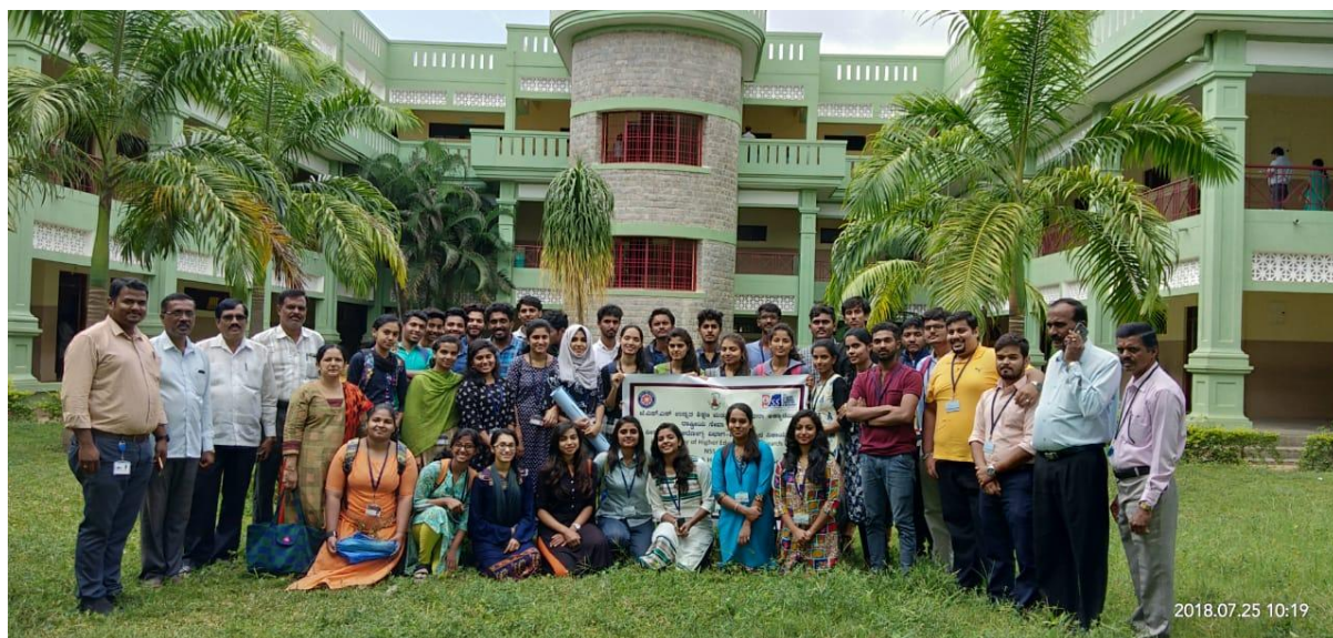
Students at JSS primary school, Suttur

Later students performed the same street play at the Government High School in Kupparavalli and JSS School, Suttur.