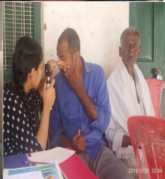
Free Medical Camp with Nutritional Assessment