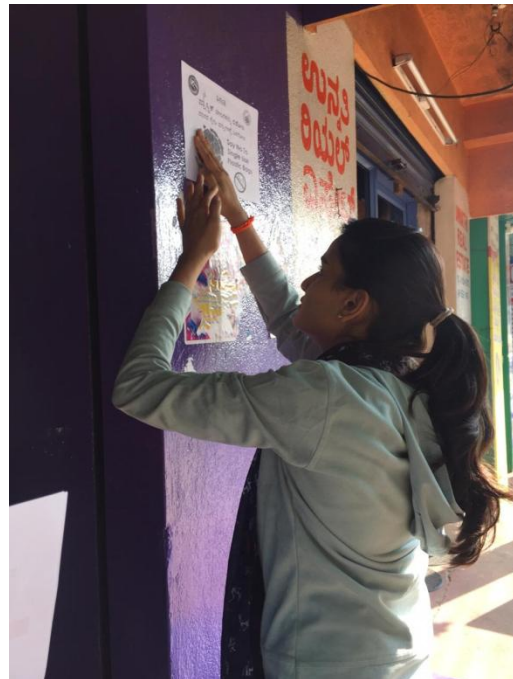
No Plastic Campaign with Clean Mysuru Foundation on Sundays.