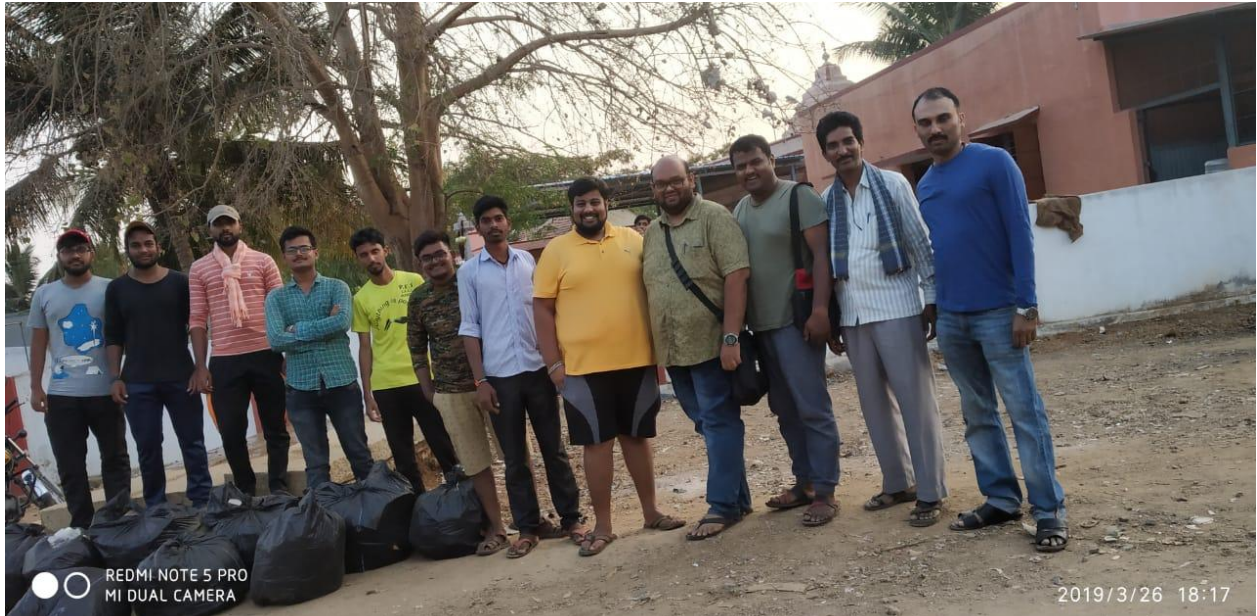
Waste Collections Drive