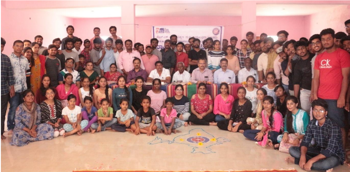
Group Picture of the Volunteers at Majjigepura