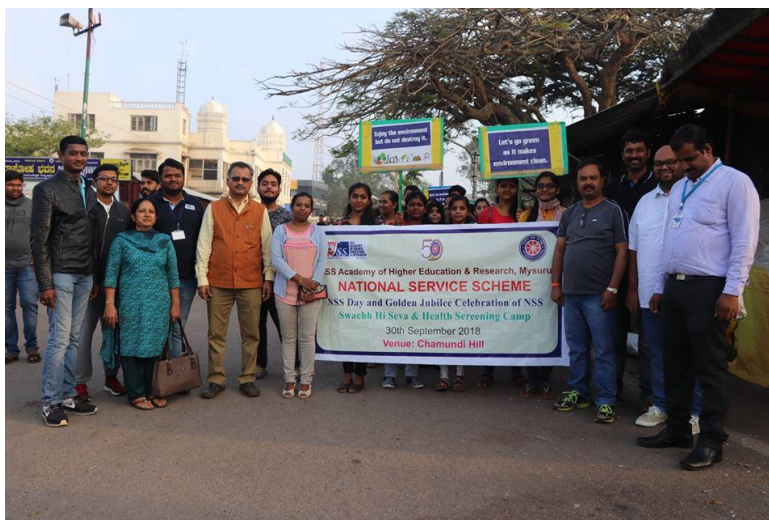
Rally on awareness of cleanliness