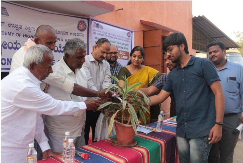
Day 1: 25/03/2019 Inauguration of the special annual camp.