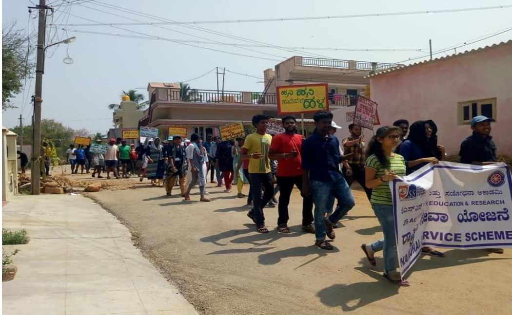
Rally on Water usage and Environmental management.