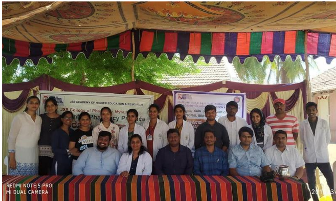
Free Health Screening camp