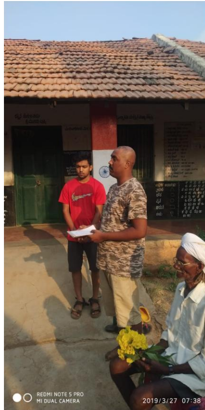
Involvement of Villagers for the flag hoisting sessions.