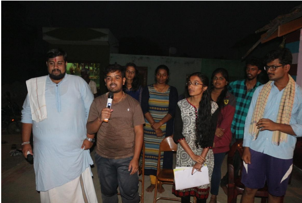
Street Play promoting elimination of Open Defecation