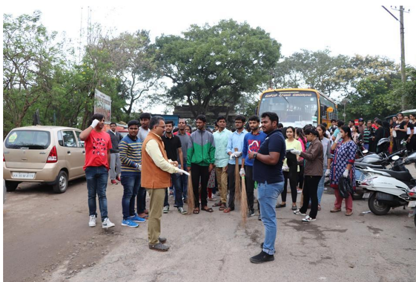
Volunteers and staff involved in cleaning sessions.