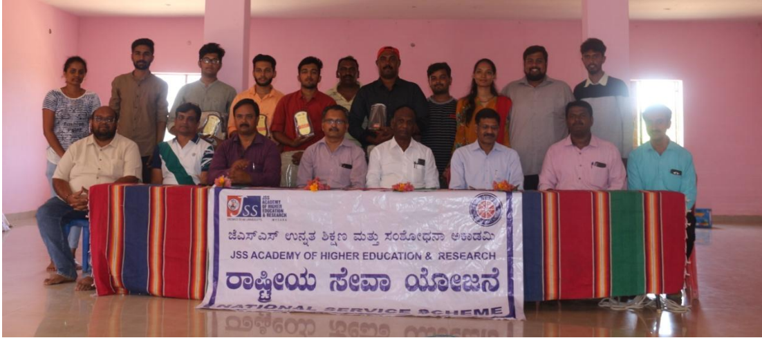
Group Photo with the best volunteers of the camp.