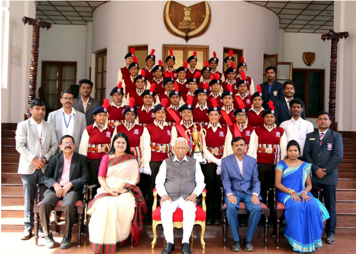
Group Photo with The Governor of Karnataka on 26 th Jan 2019.