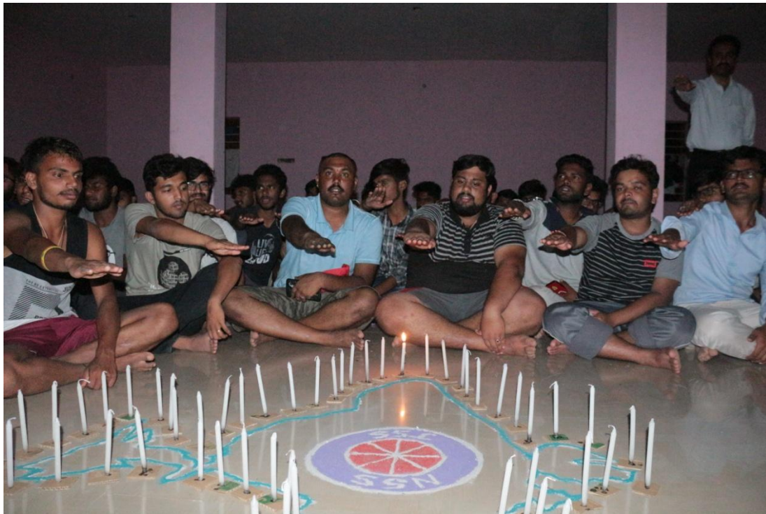
Volunteers taking oath for Swach Bharath and National Integrity