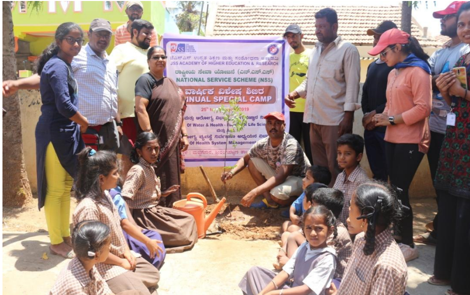
Plantation Drive at Majjigepura with students of Govt. Primary School and villagers.