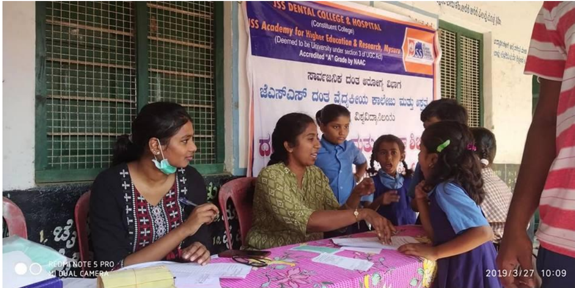
Free Dental Checkup