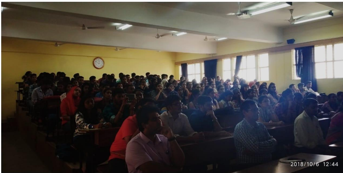
Participation by the volunteers.