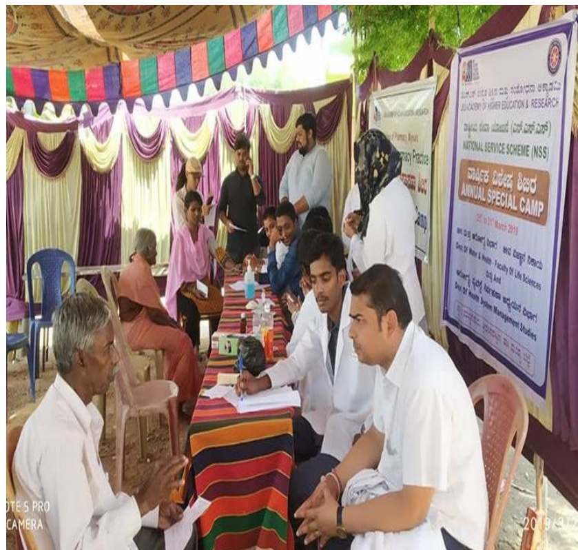
Free Dental Camp