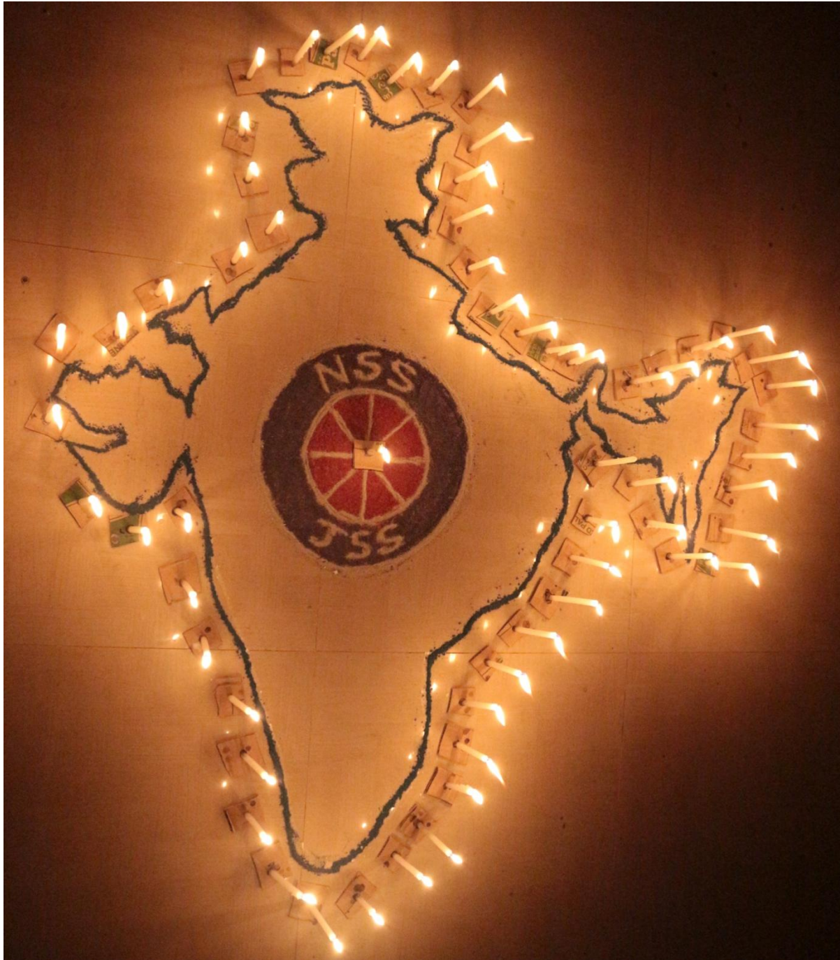
Shibira Jyoti Event