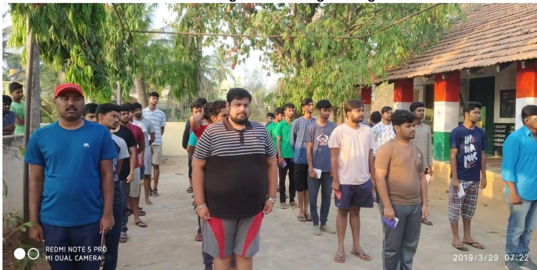
Flag hoisting sessions