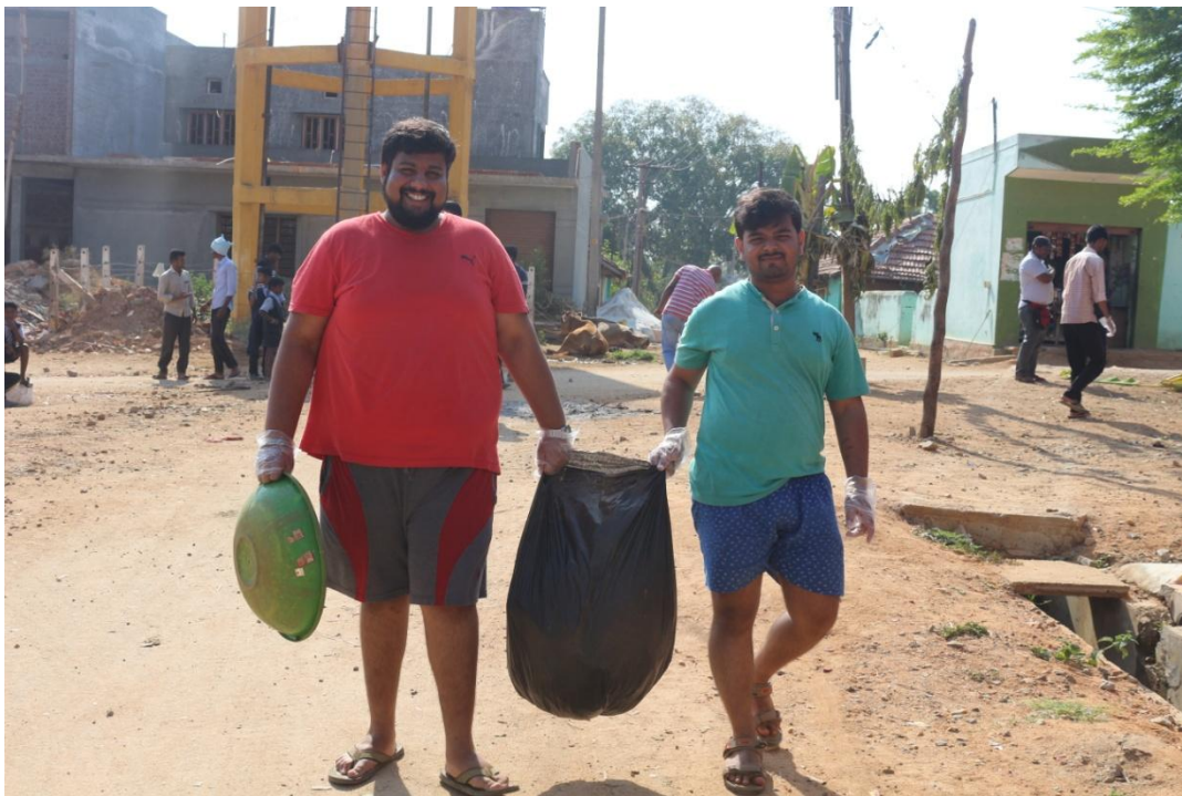
Volunteers in the shramdaan activities.