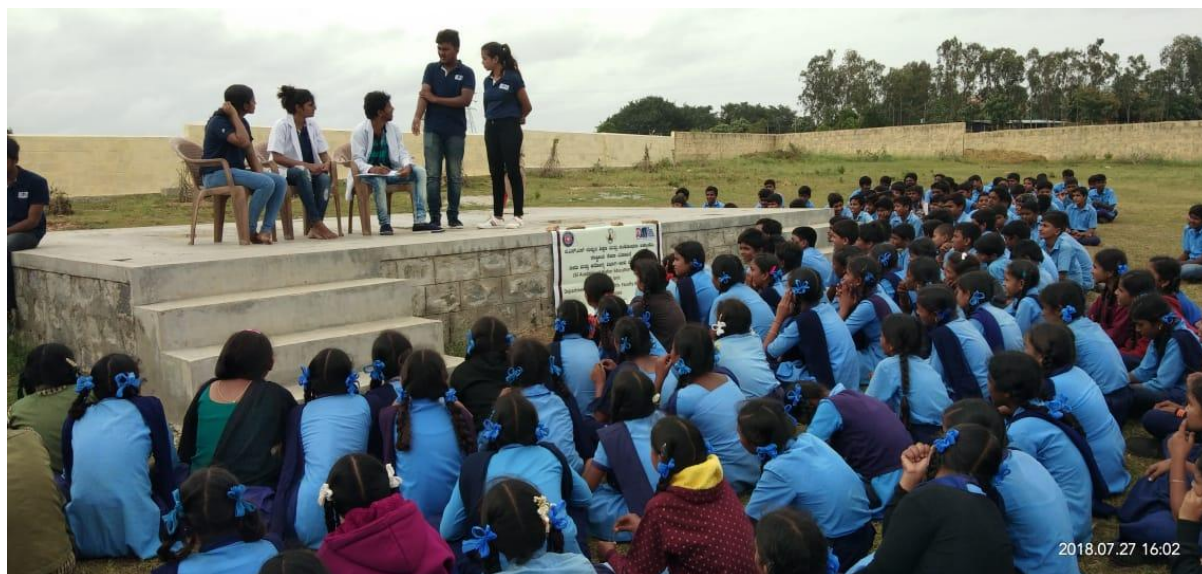
Students staging a street play at the Government High School in Kupparavalli

Later students performed the same street play at the Government High School in Kupparavalli and JSS School, Suttur.