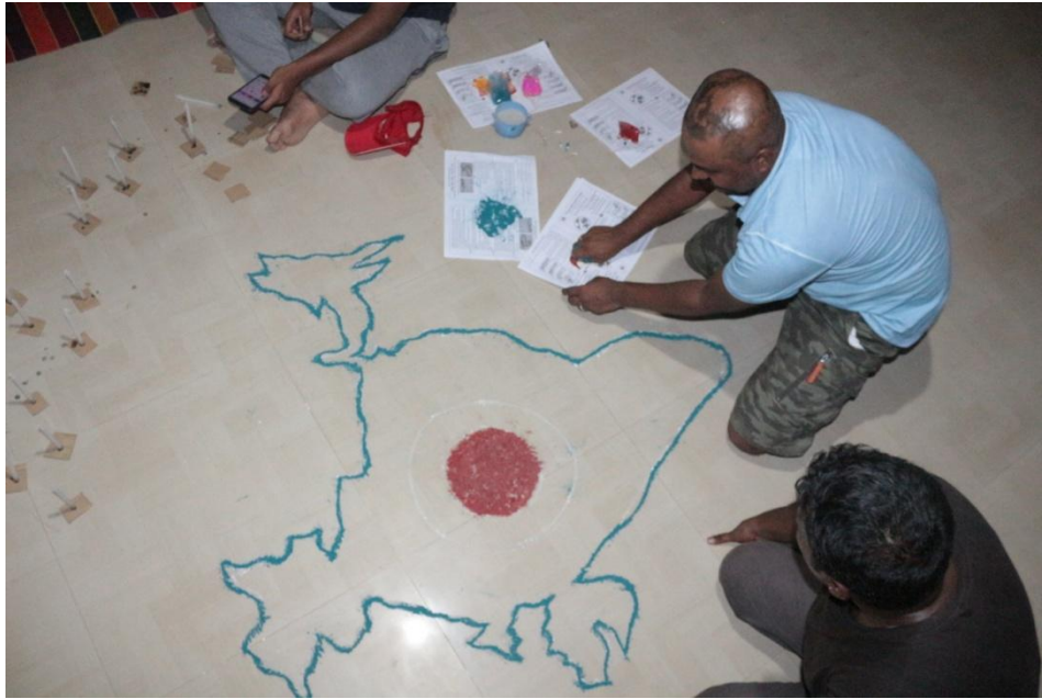
Shibira Jyoti Preparations