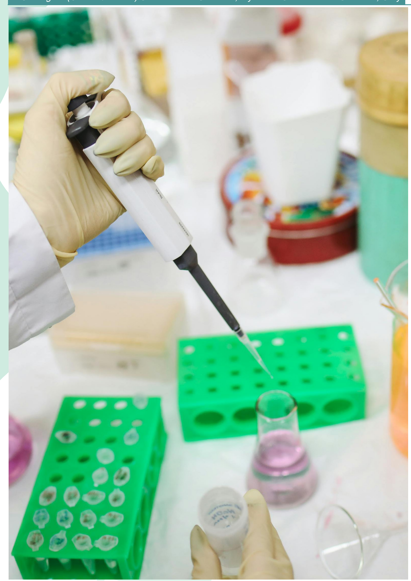
B. Sc Degree (General/Honors) School of Life Sciences, Mysuru & School of Life Sciences, Ooty